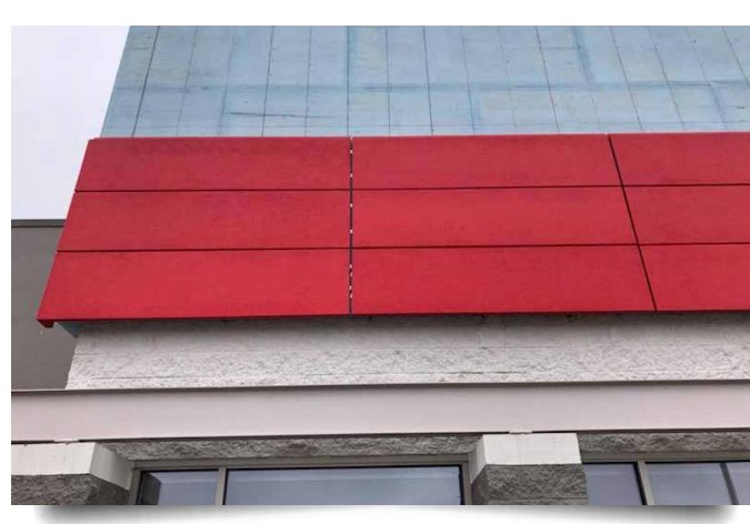
Custom red Reflectit finish, over Sandpebble fine