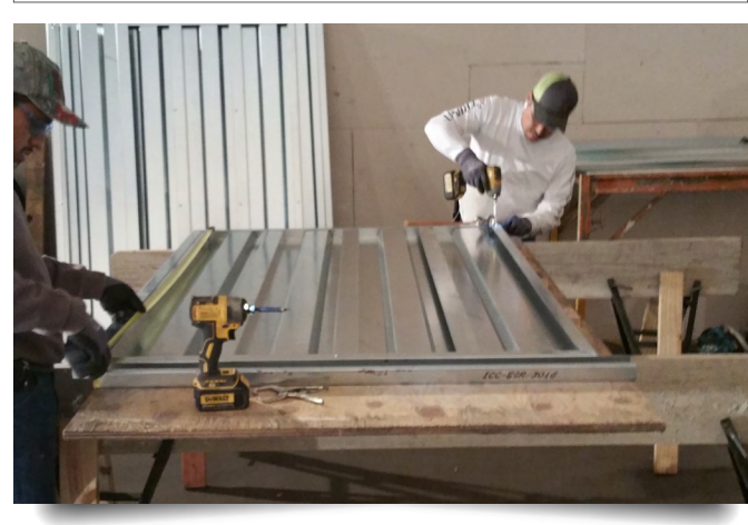
Fedderlite MP roof screen in fabrication