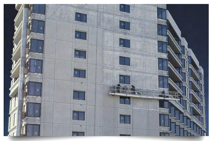
Fedderlite MP restoration over split-faced block